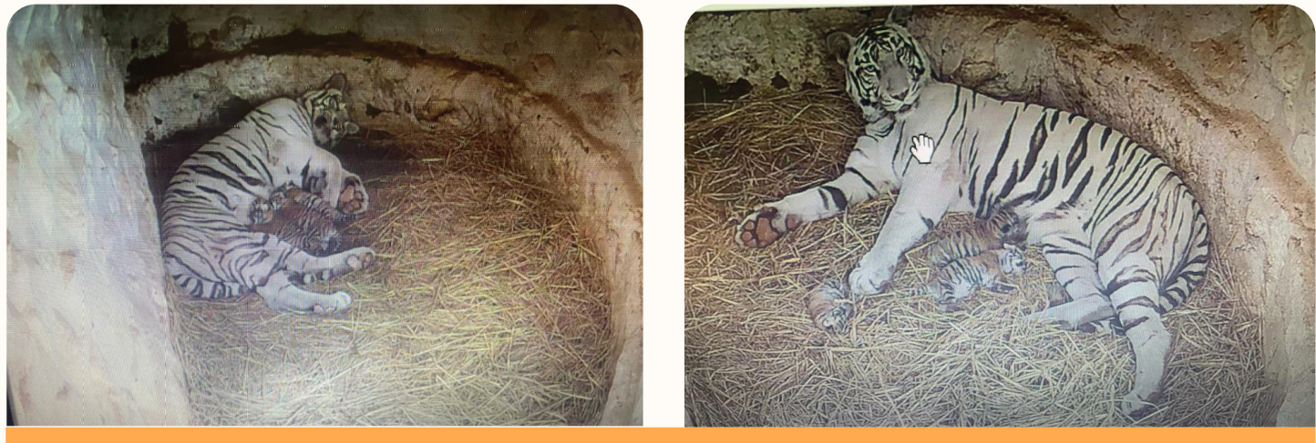
Tiger Cubs were under continuous observation through Cctv camera

The birth of these endangered species at Mysore Zoo is significantly reflecting the conservation efforts for these species.