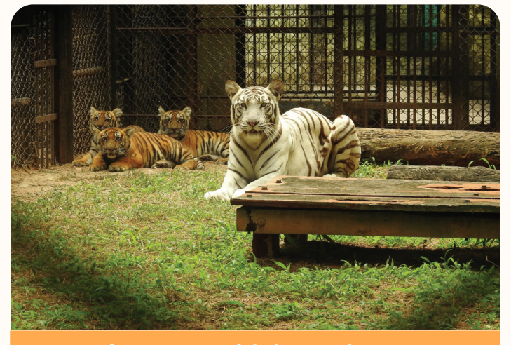
Tiger Tara with her cubs